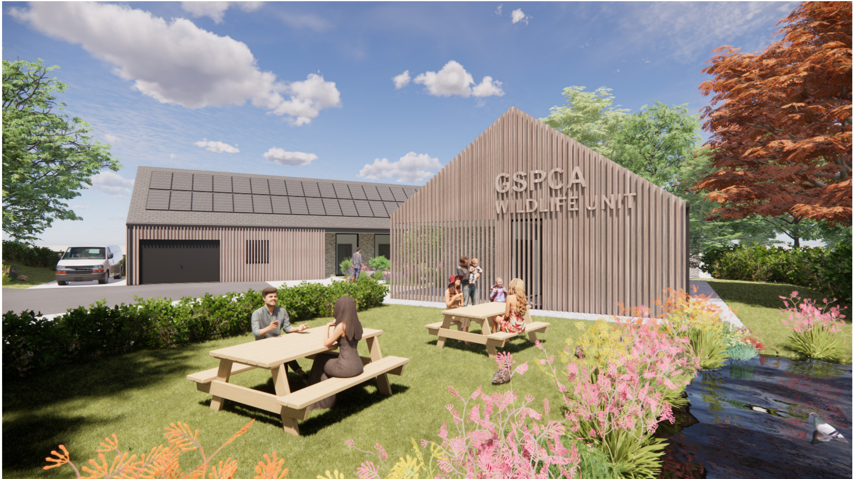
PICNIC AND POND AREA