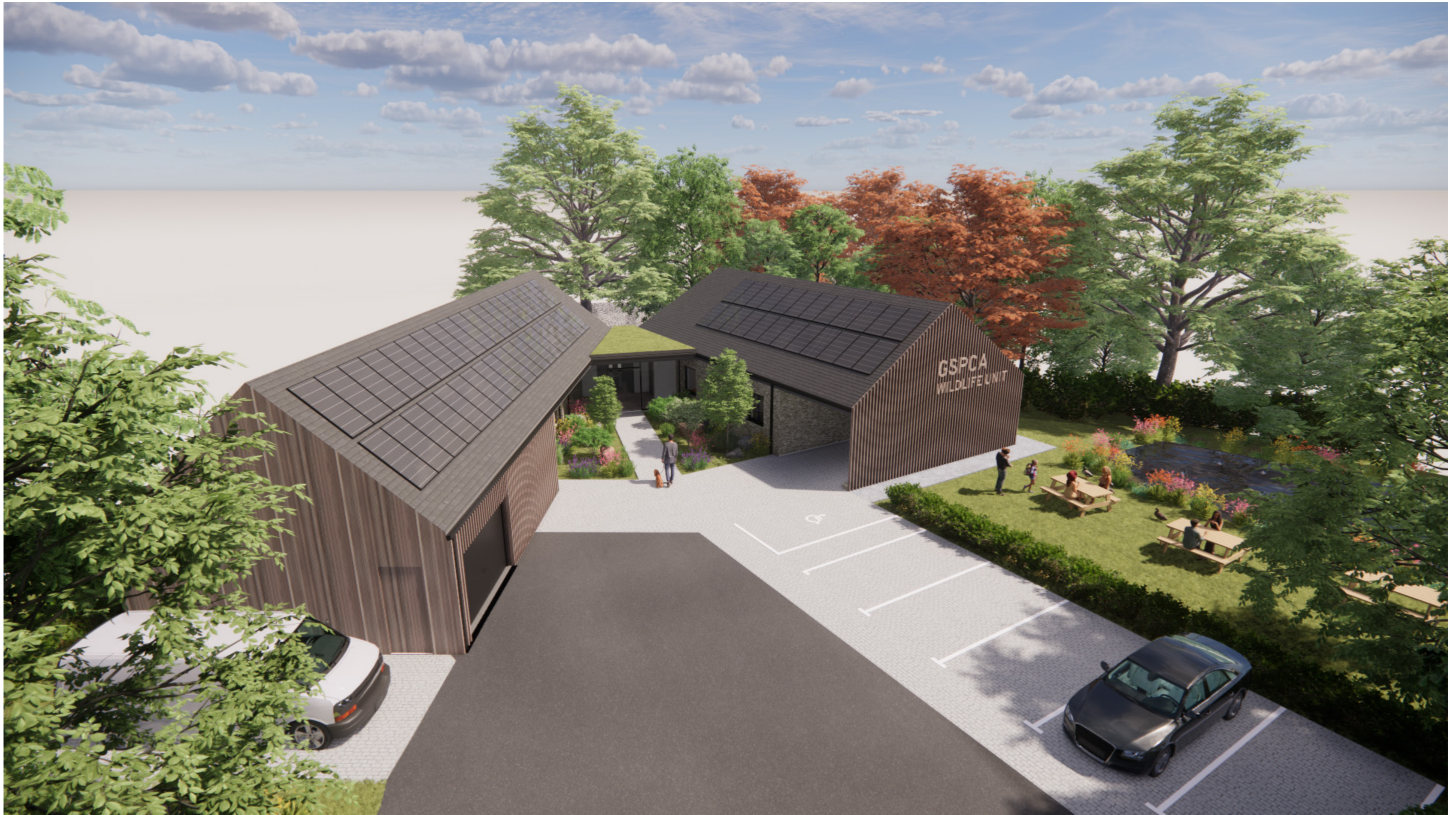
AERIAL OF PARKING AREA