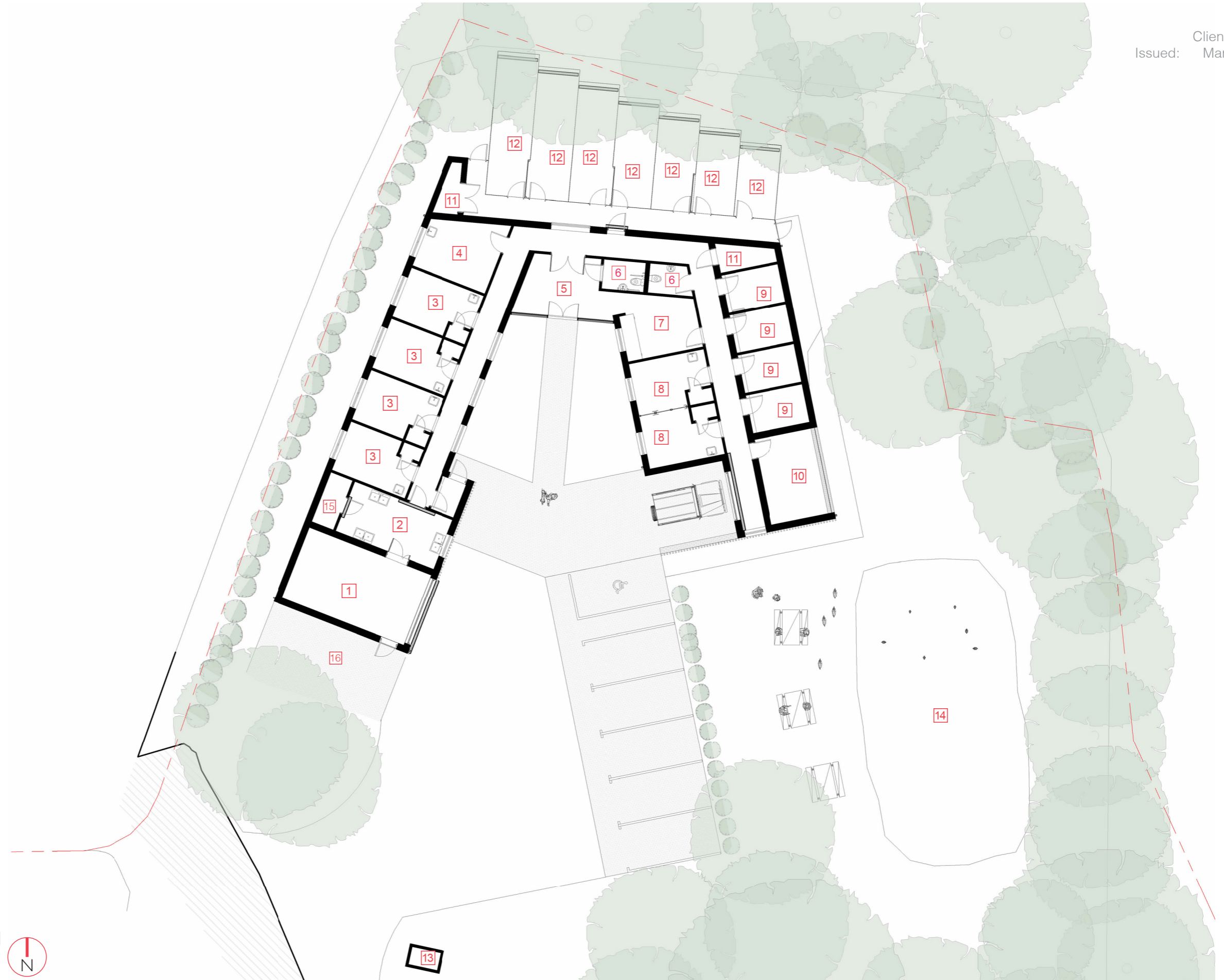
GROUND FLOOR PLAN 1:100 @ A3