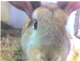
We have had more bunnies than the shelter can remember in 2011

2011 has been a very busy year with the Shelter helping well in excess of 2000 animals both wild and domestic.