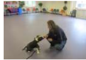
Dog training at the GSPCA

The GSPCA would like to wish everyone an enjoyable summer.