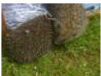
Our hedgehogs enjoying their new environment

Spring started on a good foot after a kind donation from the Friends of Wildlife enabled us to put up two soft release runs for the wildlife that we have in our care. The outside pens will be used to rehabilitate the many wild animals & birds brought into our care that are found sick or injured around Guernsey. The runs will be used primarily for hedgehogs & the first groups have already been placed in them and will