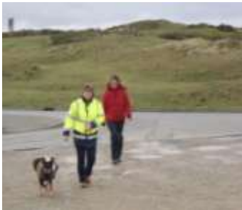
Not beaten by the weather!